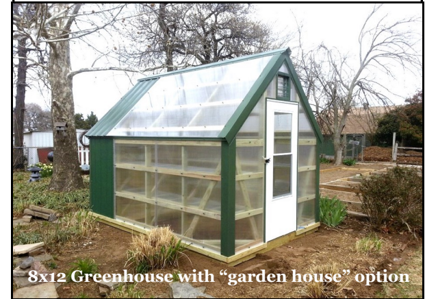
8x12 Greenhouse with "garden house" option