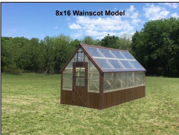
8x16 Wainscot Model